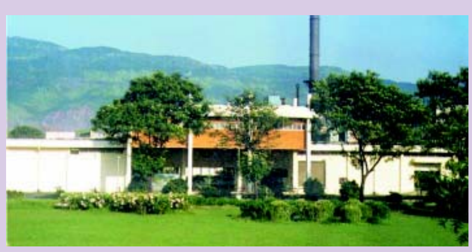
Radiopharmaceutical laboratory, BRIT, Vashi, Navi Mumbai.